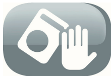
Automatic tip-over switch

High efficiency: This heater has a 99.99% heat efficiency with infrared radiation heating.